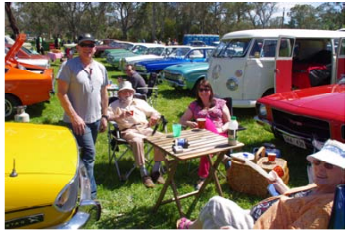
The day is one big picnic

But we arrived in Birdwood before them. And the atmosphere was electric. The roads were all lined with spectators. The general idea was to get a parking spot then get out your deck chairs and wave the entrants in. Half of the spectators were in really neat classic cars too! Absolutely everywhere you looked were neat cars. Driving or riding or parked up, they were everywhere. There were just as many cool sets of wheels outside the venue as there were in. But we went inside to have a look. Here you enter a different world.