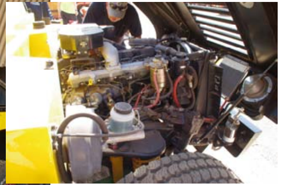
It says Hummer on the number-plate, but tilting the bonnet reveals a Nissan Patrol diesel with an aftermarket Turbo