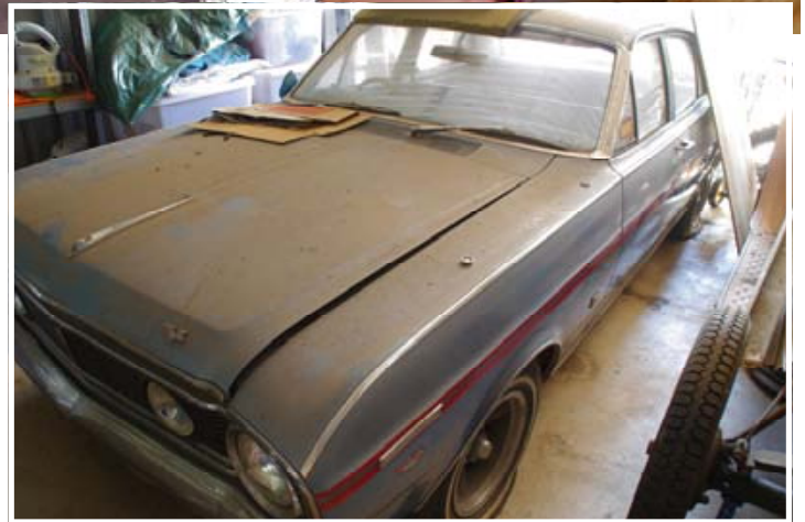
Above: Dusty XR V8 Falcon purchased new in 1968.