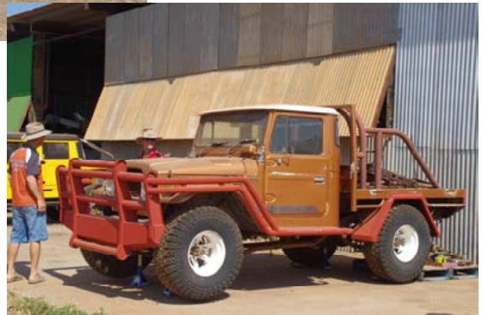
A grunty looking Toyota. The guards have been widened to accommodate those big wheels and the running boards have been widened to match.

As you walked around the yard it was a bit like the ever expanding universe where you keep on finding more goodies. There was a tiny Datsun 1000 ute. It might have been the first one they ever made. Remarkably straight too. Naturally there were old Holdens keep-